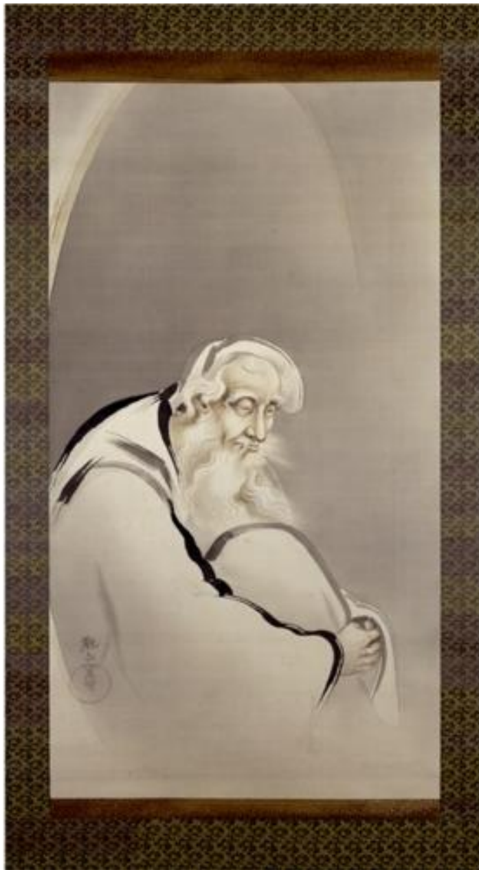
Shimomura Kanzan: Diogenes , 1903. Ink and Color on silk, 30 x 72 cm. British Museum, London